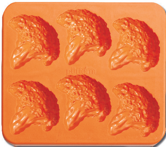
Silicone mould - broccoli Order no.: G-10050