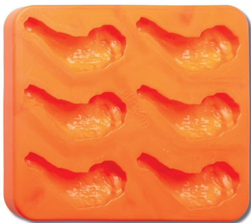
Silicone mould - chicken legs Order no.: F-10050