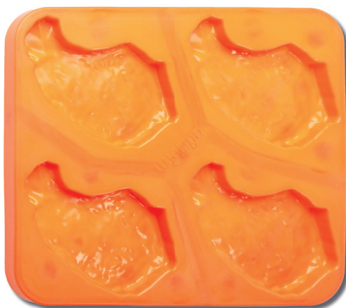
Silicone mould - cutlets Order no.: F-10000